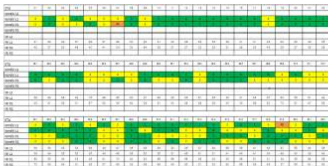
Fig 2. Street Map Data Strip

To optimize road handling in Bangka Belitung Province before made a determination, it is necessary to conduct a road condition survey first to obtain IRI and PCI values from each STA on each road segment. Based on the implementation in the field, the survey method with guidance from IRMS requires a longer survey time in the field where the input process for road coordinate data was input.